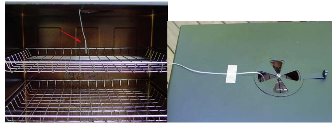
Figure 3. Sensor position. Left, the sensor should be placed close to the food but high enough so that it does not touch the food. Right, hold the sensor in place by a piece of tape.

The controller is supplied with two probes. The one with short tip is for measuring the cabinet temperature. We name it probe 1. It needs to be plugged to the top sensor jack at the back of the controller. The long probe with a bend at the end is for the meat internal temperature measurement. It needs to be plugged to the bottom sensor jack at the back of the controller. The tip of the probes is dropped into the damper hole. Place a piece of tape on the top of the smoker tower to hold them in place. The tip of probe 1 should be placed close to the food but high enough so that it does not touch the food. (See Figure 3). The tip of probe 2 is to be inserted into the meat.