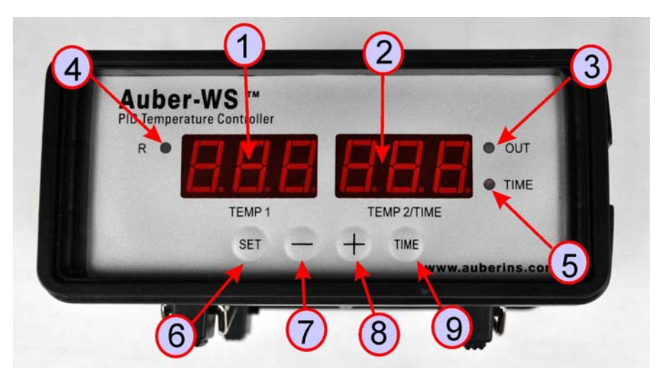
Figure 1. Front Panel