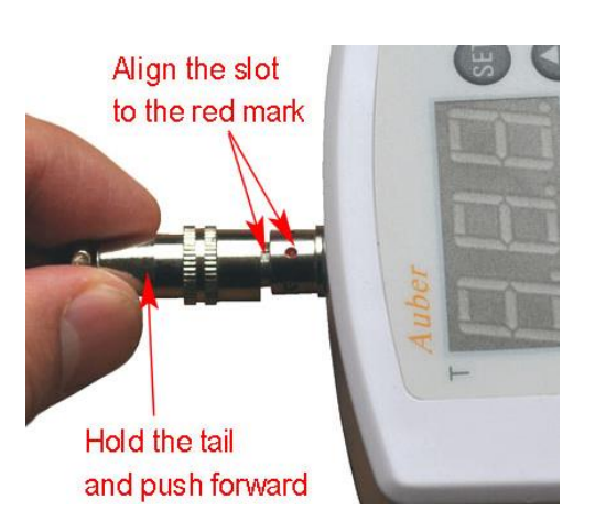
Figure 3. Install the Sensor

the female connector on the sensor to the red mark of the male connector on the unit, then hold the tail and push the female connector forward. To remove the connector, please pull the spring loaded collar of the female connector. Please see the Figure 3 and Figure 4 below for details.