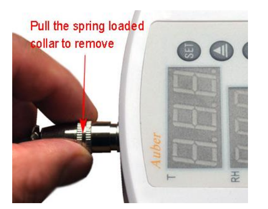
Figure 4. Remove the Sensor