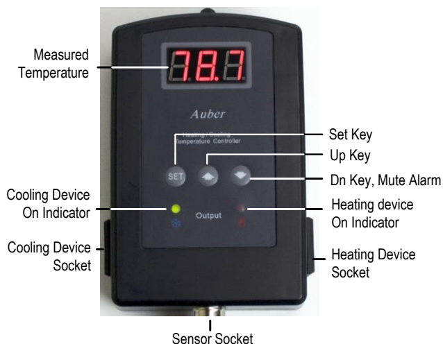
Figure 1. Front Panel